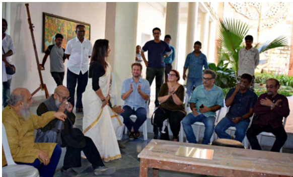
All the Artists from Germany and India during the interactive session "East meets West".

* East meets West - An interactive session between German and Indian Artists discussing their approach to art and works.