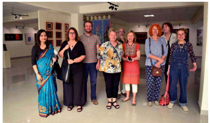
German artists at Bengal Contemporary Art Gallery, ArtsAcre.

We are starting with two new regular courses for adults. Ceramic/Raku and Painting.